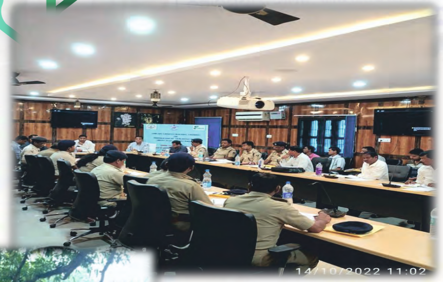
Capacity Building Training for Preparation of Livelihood Plan at Bonai Division