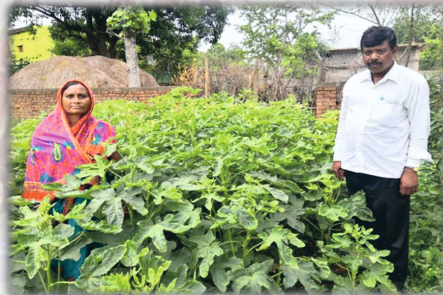
Kitchen Garden by vegetable minikit at Mishrapali VSS area of Rourkela Division- An AJY Convergence initiative