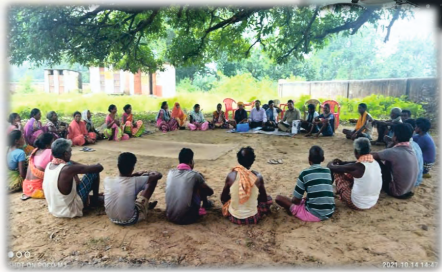
VSS General Body Meeting at Gamhardi VSS, Rourkela Division