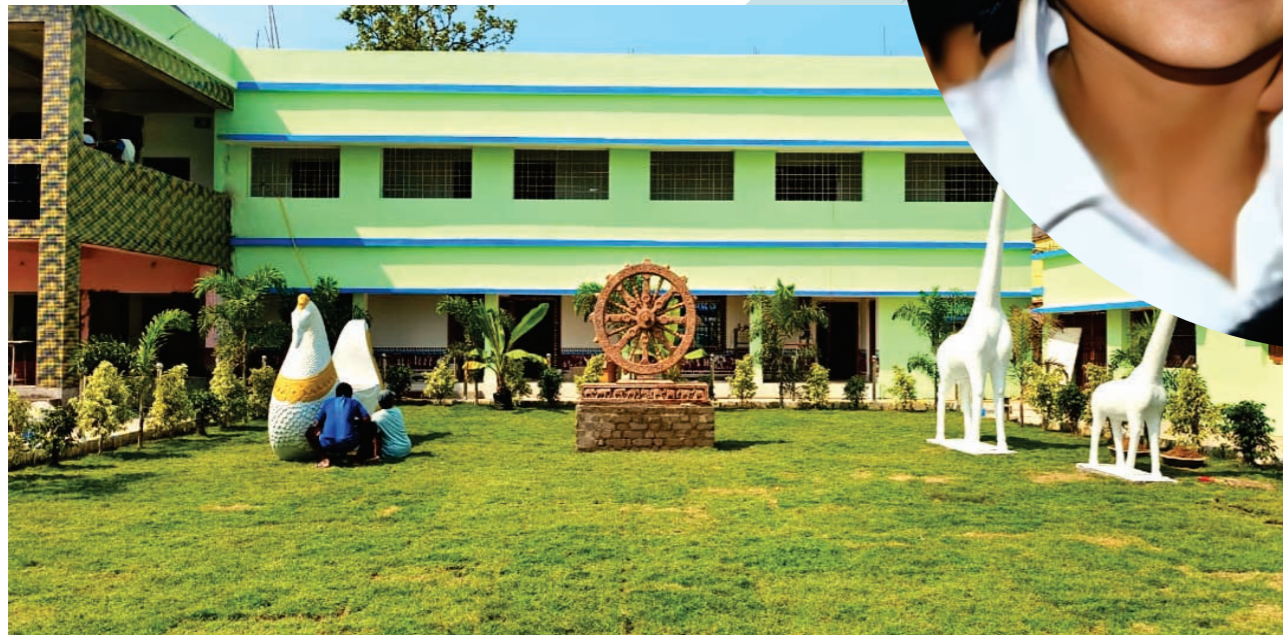
Additional Classroom at L.N. HS, RAMCHANDRAPUR, Ghasipura Block, Keonjhar