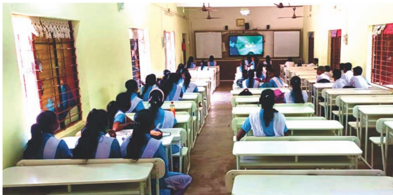
N.K High School Barhatipura, Block- Ghatgaon, Keonjhar