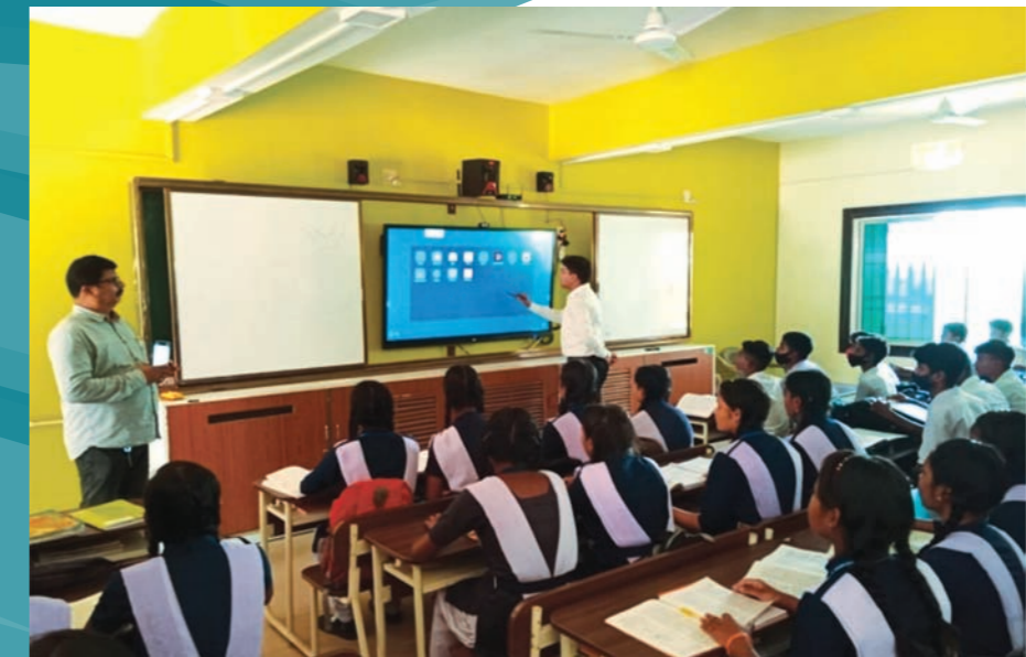
Smart Classroom facilities at Balibandha School, Jhumpura Block, Keonjhar