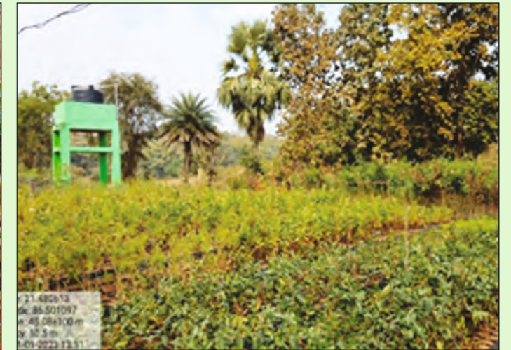
6 months old seedlings at Sudsudia Central Nursery, Keonjhar