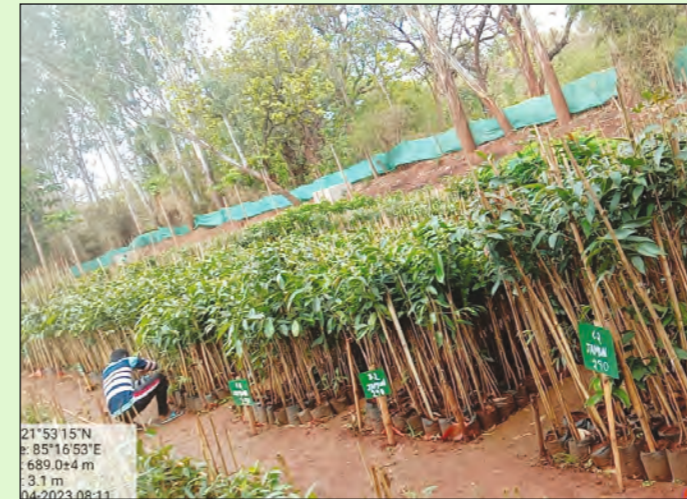
18 months old seedlings at Karanja Nursery, Mayurbhanj