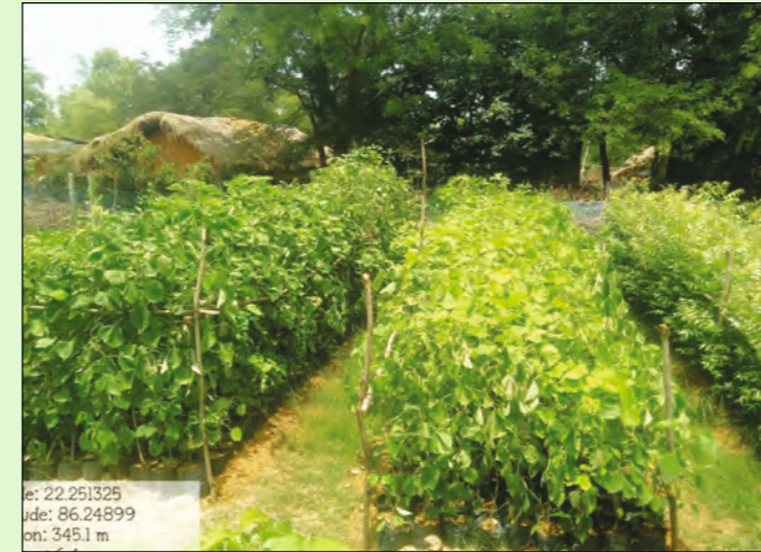
6 months old saplings at Keonjhar Nursery