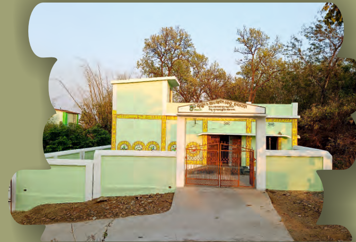
Name of Site: Health Sub-Center Building at Nandapara Village of Lahunipada Block, Sundargarh

Before establishment of this Sub-Center Building, no Government health facilities were available in the area. 8 villages with a total population of 5620 are being provided with health services through this Health Sub center.