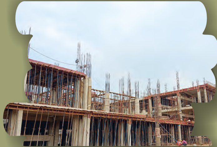
Construction of MCH Building at Jaipur

This project has been taken up as an additional facility to Jaipur's current medical college which is under construction. The MCH wing will function as an extension wing of the medical college and will benefit the entire district of Jajpur and adjacent areas.