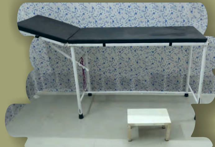
Project Name: Procurement Medical Equipment in Health Facilities in Mayurbhanj District Name of Site: CHC Gorumahisani

Before establishment of this Sub-Center Building, no Government health facilities were available in the area. 8 villages with a total population of 5620 are being provided with health services through this Health Sub center.