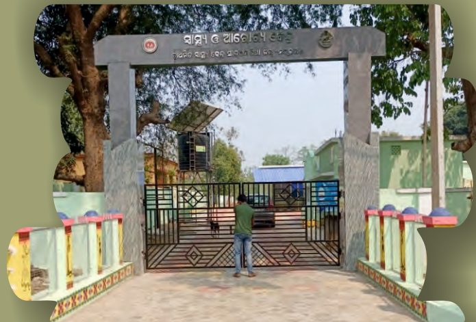
Construction of Public Utility in PHC Dova

This project has been taken up as an additional facility to Jaipur's current medical college which is under construction. The MCH wing will function as an extension wing of the medical college and will benefit the entire district of Jajpur and adjacent areas.