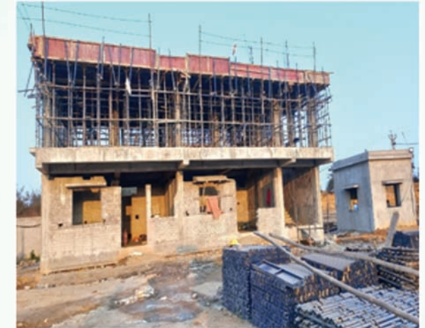
WTP of Mega PWS to 285 Villages in 04 Bolcks of Sundargarh District (4 Nos Blocks- Bisra, Bonei, Lathikata, Lahunipada)