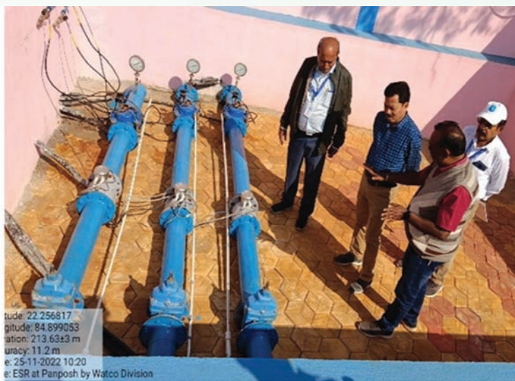
Latitude: 22.256817 Longitude: 84.899053 Elevation: 213.63±3 m Accuracy: 11.2 m Date: 25-11-2022 10:20 Location: ESR at Panposh by Watco Division