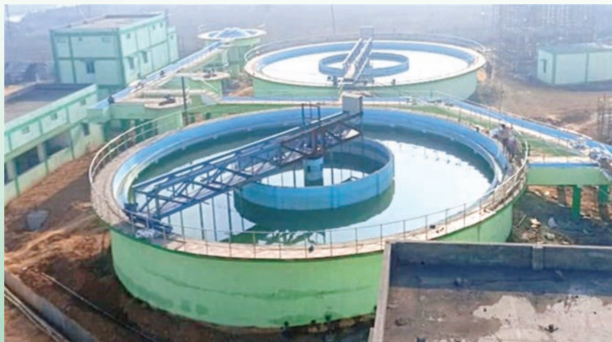
Water Treatment Plant- Kutra at Kutra