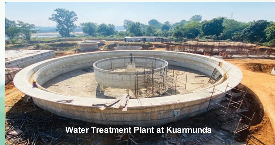
Water Treatment Plant at Kuarmunda