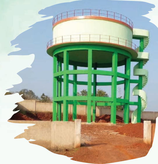
Elevated Service Reservoir at Hemgiri block

With out 24*7 Drink from Tap in Biramitrapur ULB