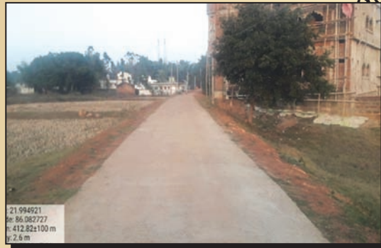
CC Road from Mahardapalsa to Machhakanda Road of Jashipur Constituency, Mayurbhanj