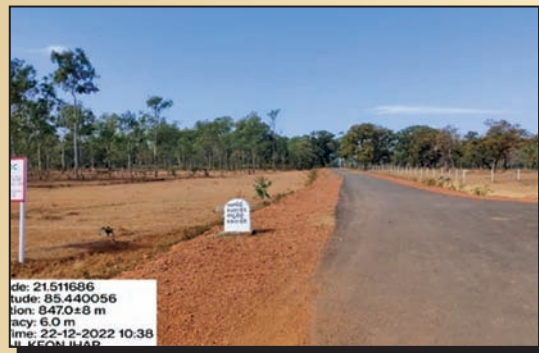
BT Road from Badapadia to Tantadihi of Banspal Block, Keonjhar

Odisha Mineral Bearing Areas Development Corporation (OMBADC)