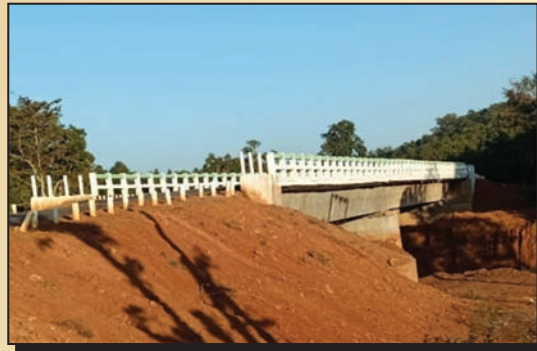
Bridge over Local Nallah on Birkeria to Sagapali Road of Banspal Block, Keonjhar