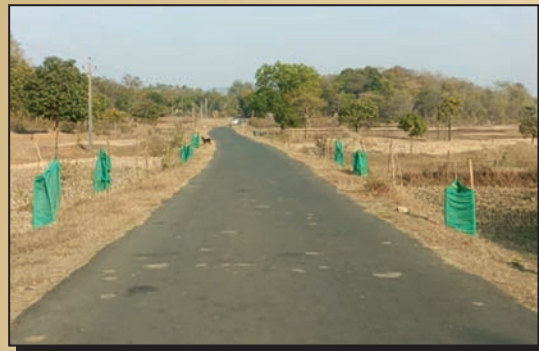
BT Road from BaradapalChhak to Ankurapal Road of Sukinda Block, Jajpur