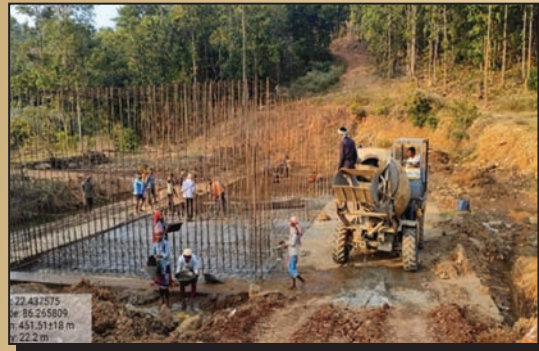
CD work on RD Road to Mankagoda Road of Rairangpur Block, Mayurbhanj