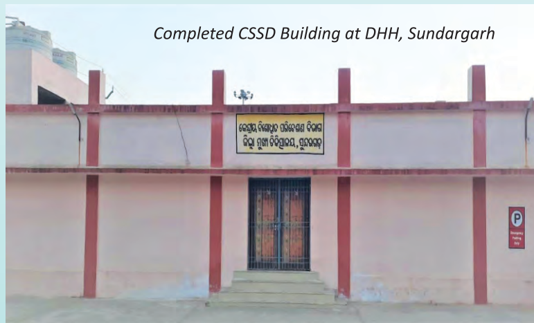
Completed CSSD Building at DHH, Sundargarh

The DHH at Sundargarh serves good no. of IPD patients requiring surgery cases. The newly constructed CSSD building will support the additional load of sterilization of medical equipment to attend to the increased surgery cases.