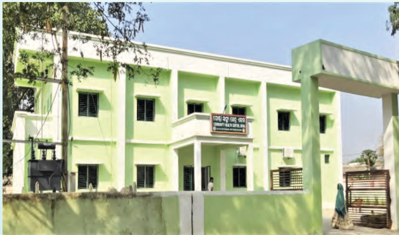
New OPD building at CHC Ekma, Sundargarh

The new OPD building has been developed to cater to the needs of the increasing no. of patients in the block.