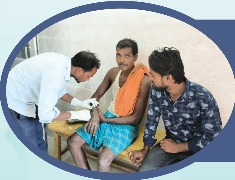
Treatment of a patient under progress at Barangakachar PHC, Bargaon Block

Odisha Mineral Bearing Areas Development Corporation (OMBADC) 1 st Floor, Aranya Bhawan, GD-2/12, Chandrashekharpur, Bhubaneswar, Odisha-751023 Email: ombadc@gmail.com, Tel: 0674-2300488 www.ombadc.odisha.gov.in