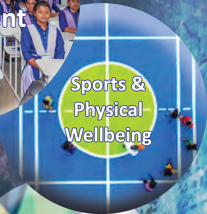
Sports & Physical Wellbeing