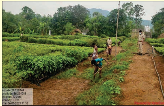
Nursery raised with support from Forest Range Officers, Hadagarh Wildlife Range, Keonjhar