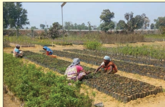
Dharanidharpalli of Sundargarh District

Odisha Mineral Bearing Areas Development Corporation (OMBADC) 1 st Floor, Aranya Bhawan, GD-2/12, Chandrashekharpur, Bhubaneswar, Odisha-751023 Email: ombadc@gmail.com, Tel: 0674-2300488 www.ombadc.odisha.gov.in