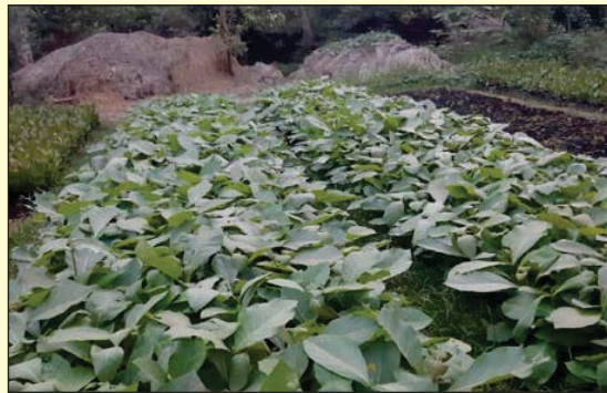
Glimpse of 35000 seedlings raised for the purpose of distribution in Baranga Village, Ganpur GP, Keonjhar