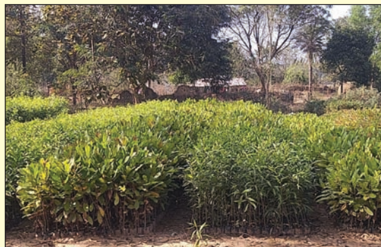
Godhimara Nursery of Mayurbhanj District